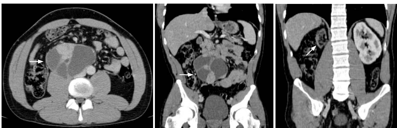
FIGURE 1. Axial and coronal contrast-enhanced abdominal and pelvic CT scan showed a large complex cystic and solid retroperitoneal mass on the right side of the aorta (arrowheads). This lesion involves the right ureter with consequent right kidney atrophy (arrow).

Scrotal ultrasound revealed scattered microcalcifications and scar tissue on the right testicle, without distinct testicular masses or nodules suspected of malignancy (Fig. 3).